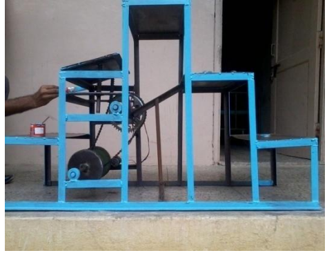
Fig. 2 Fabricated Model